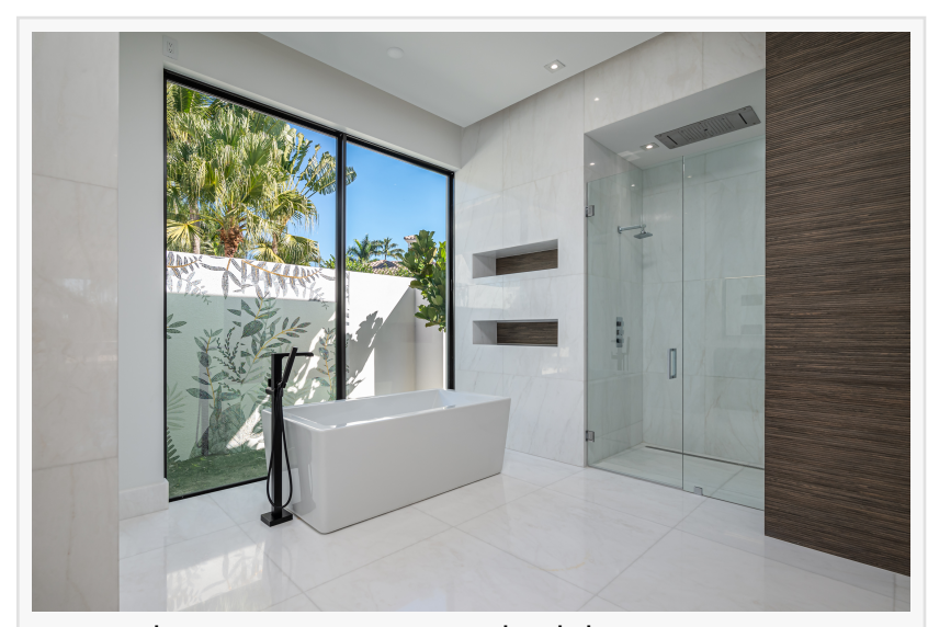
General Contractor Fort Lauderdale

Building or <u>remodeling a home</u> is a major investment, both financially and emotionally. In South Florida, homeowners face a complex environment that combines local building codes, environmental factors, and the desire for custom luxury designs. Having an experienced general contractor with a deep understanding of these challenges is key to achieving a successful project.