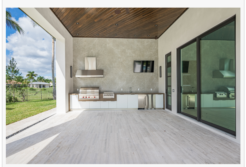
General Contractor Broward

South Florida's luxury real estate market requires precision and expertise. Custom home builders must meet the specific needs of homeowners while tackling the unique hurdles posed by the local environment, such as hurricane-resistant construction and flood zone regulations.