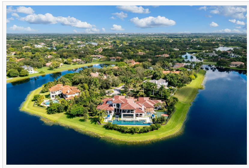
Home Builder Plantation