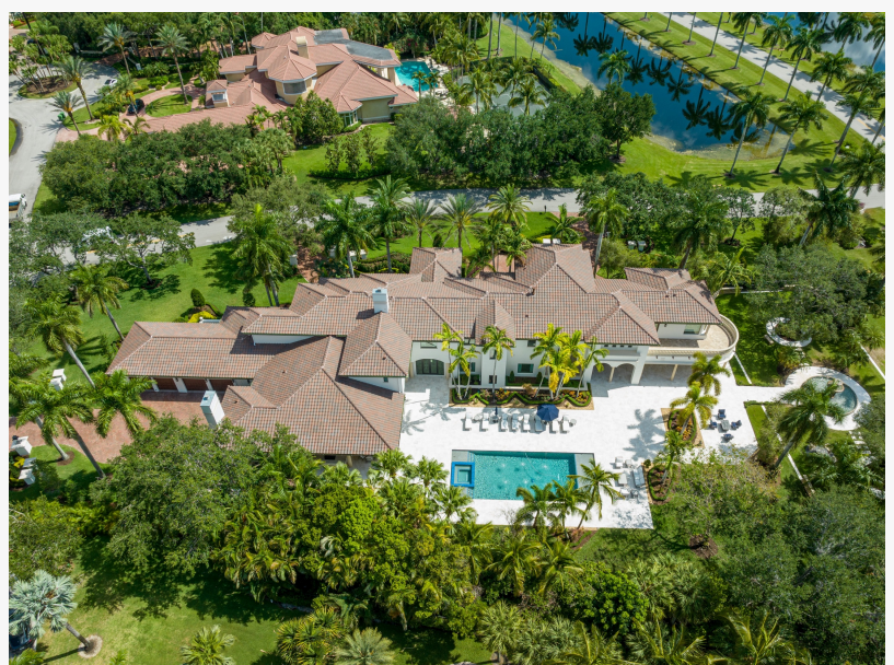
Windmill Reserve New Construction Homes

Permitting and approvals are another complex aspect of demolition and rebuilding in Plantation. Navigating local regulations and building codes requires a contractor well-versed in the specific requirements of Hawks Landing and Plantation Acres. Thomas Homes has established relationships with local authorities, which can expedite the permitting process and help minimize delays.