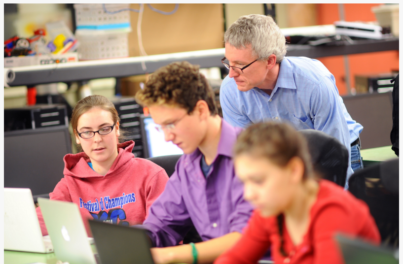
Computer Science at MSSM