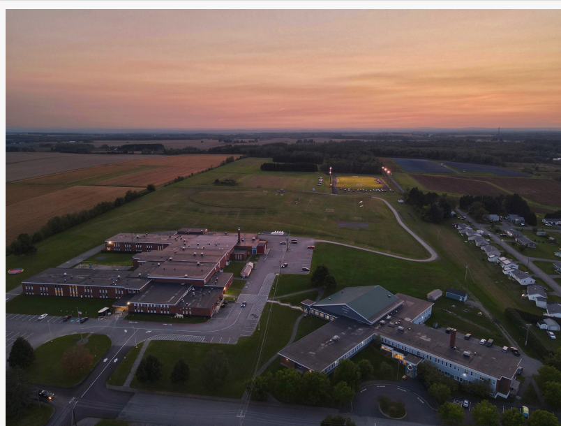
MSSM Campus in Limestone, Maine

MSSM stands apart as both a residential high school and a magnet school in Maine, offering students a distinctive educational experience that combines advanced academics with the benefits of a close-knit living environment. The school's residential model fosters deep connections among students, creating a vibrant community where shared academic goals and personal growth go hand in hand. The residential life experience is often one of the most formative aspects of attending MSSM, as students live, learn, and collaborate with their peers, building lifelong friendships along the way. The school's selective admissions process ensures that students who attend MSSM are not only academically driven but are also prepared for the challenges of an accelerated curriculum. This environment allows gifted students to work alongside others who share their intellectual curiosity and commitment to excellence. By drawing students from across Maine—and in some cases, from around the country—MSSM brings together a diverse and motivated group of learners.