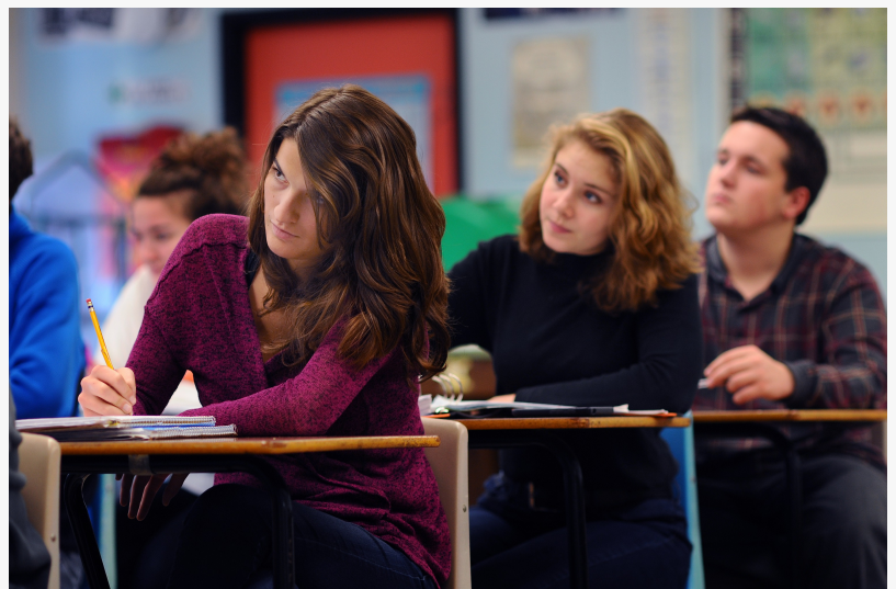
Students taking advanced classes at MSSM in Limestone, Maine.

The style-moving story that rides MSSM from its infancy in the 1990s to one of the best standing public secondary high schools in the US has not only been wrong in imagination but rather wrong in fruition. What the past 30 years have shown us is that MSSM with its selective criteria and majority of STEM orientated courses with moving into dormitory