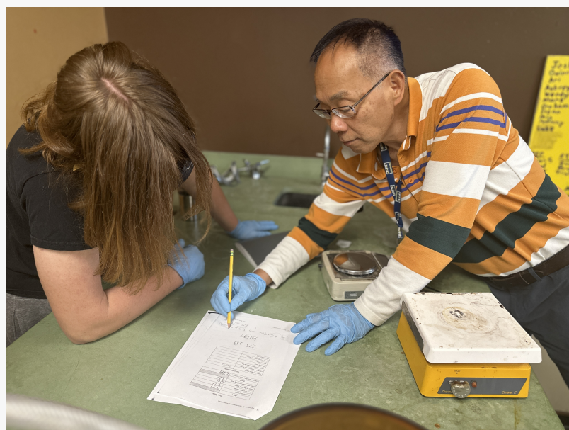
Students learn from world-class faculty in college level classes at MSSM