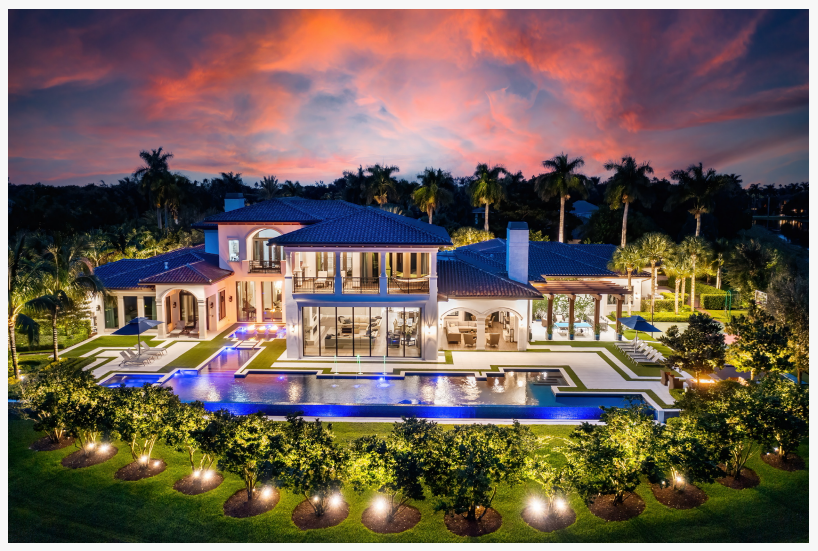
Construction company Fort Lauderdale

construction contract price, providing an additional financial incentive to participate in this program.