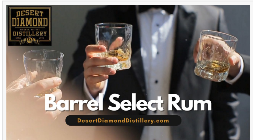
Desert Diamond Distillery Barrel Select Program

1. Personalized Corporate Gifting: In today's competitive business environment, personalized gifts are more than just tokens of appreciation; they show genuine value and recognition of