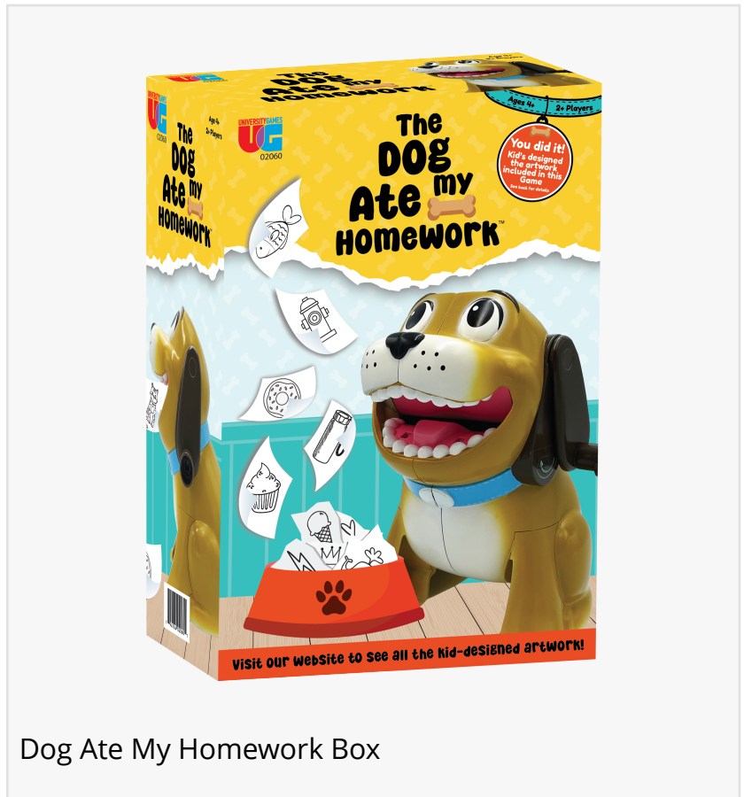
Dog Ate My Homework Box