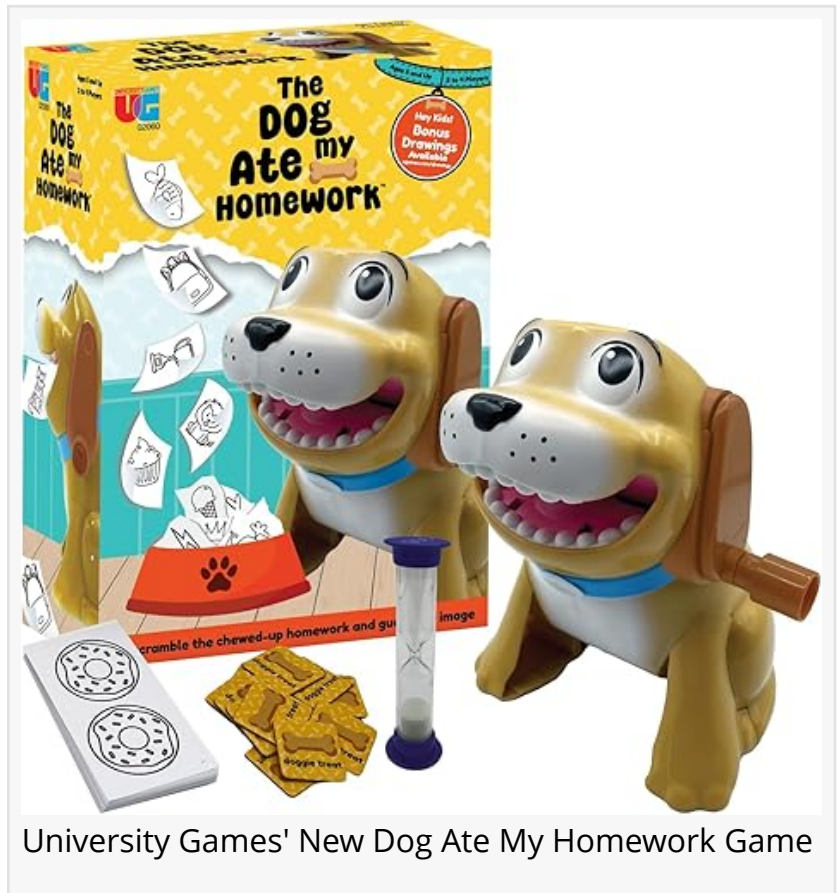
University Games' New Dog Ate My Homework Game