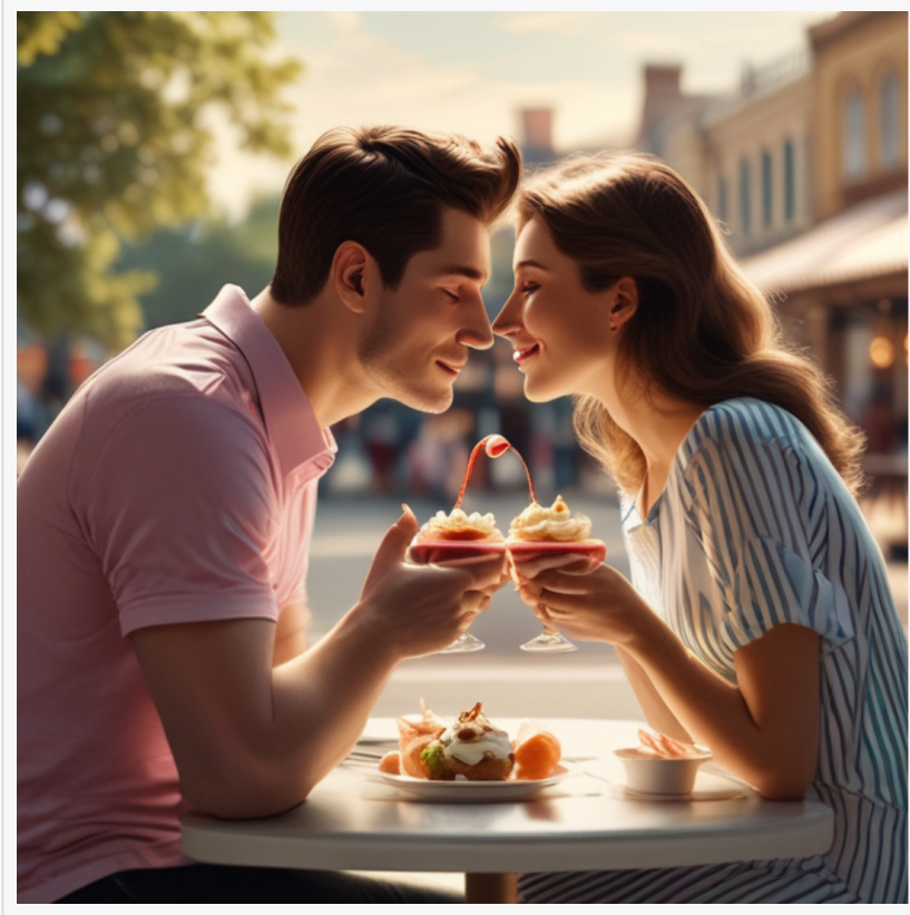
The right partner is the cherry on top. You are already the whole sundae.

The Dare to Date Challenge has attracted a dynamic audience - career-driven women, devoted single moms, and those who have experienced toxic relationships, all eager for a fresh start. These women are ready to move beyond the frustration of modern dating and find aligned partners who respect their values, priorities, and vision for the future. The challenge speaks directly to women looking for more than just a relationship; they want a connection built on mutual respect, love, and trust.