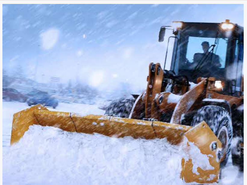
D&J Contracting Inc - Snow Removal Salting

Unlike residential snow removal, commercial properties face unique challenges, such as larger