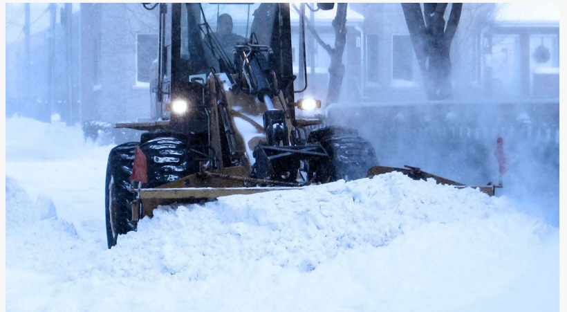
Snow Removal & Salting