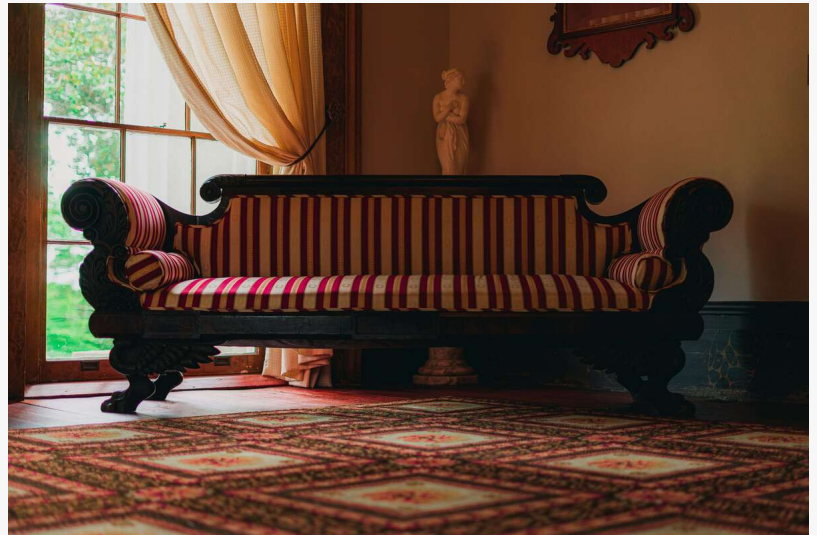
Upholstery Cleaning in Beverly Hills, ornate red couch

With over 20 years of experience in the industry, the company offers cleaning services that utilize eco-friendly products, ensuring the health and safety of the home environment while preserving the integrity of the furniture. The company's professional cleaning methods aim to remove allergens, dust, and debris from deep within the fibers, contributing to a cleaner living space.