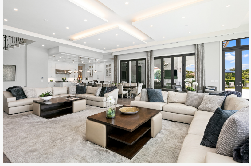
Custom design Fort Lauderdale

difference between a stable, long-lasting property and one vulnerable to severe coastal conditions. Selecting the right seawall is a critical step in building a durable and secure waterfront home," says Thomas.