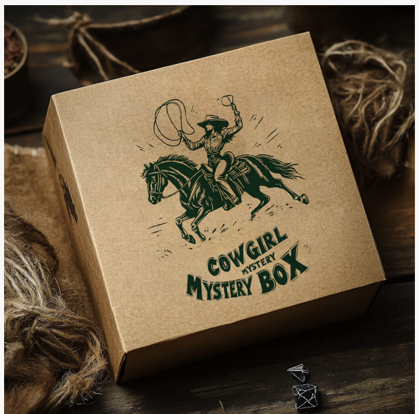
Montana West Mystery Box

has flourished across social media platforms, particularly on TikTok, Instagram, Facebook, and online boutique stores, where customers have been sharing their excitement and unboxing experiences.