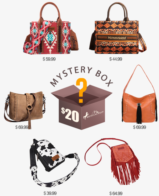
Montana West Western Mystery Box