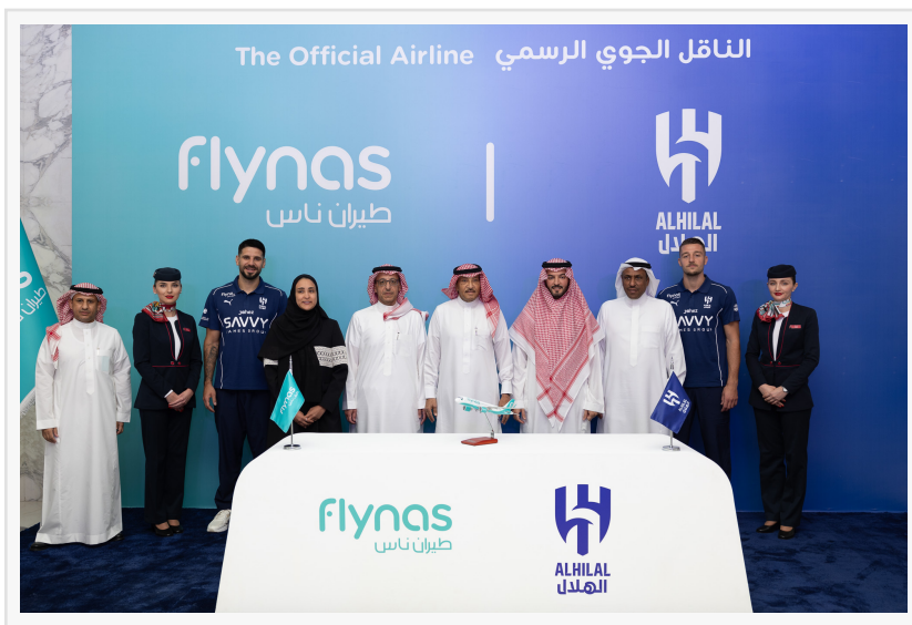
Agreement Signing Ceremony(3)

flynas connects more than 70 domestic and international destinations with more than 1500 weekly flights and has flown more than 80 million passengers since its launch in 2007, with the aim to