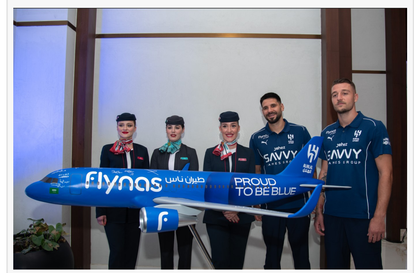
Agreement Signing Ceremony(4)

reach 165 domestic and international destinations as part of its growth and expansion plan launched under the slogan "We connect the world to the Kingdom," in line with the objectives of the Vision 2030.