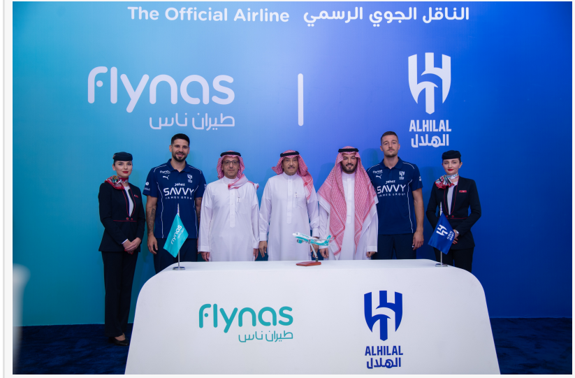
Agreement Signing Ceremony(2)

support the economy and tourism. This step will also contribute to providing extensive services and products that meet the aspirations of our traveling guests. Our partnership with Al-Hilal Club is consistent with the company's position as one of the 4 top low-cost airlines in the world and the best LCC in the Middle East, as Al-Hilal Club has a remarkable track record of success locally