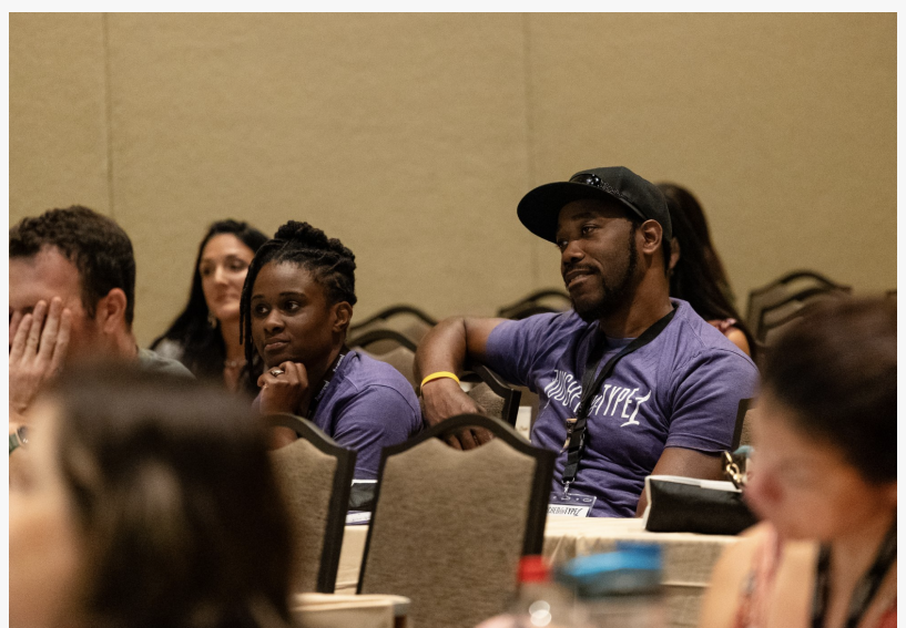
Attendees of the Touched by Type 1 Annual Conference

As Touched by Type 1 looks forward to future events, the organization remains committed to its mission of supporting the type 1 diabetes community through programs that educate, inspire, and connect. The overwhelming success of this year's conference is a testament to the strength and resilience of the community and underscores the importance of continued advocacy and support.