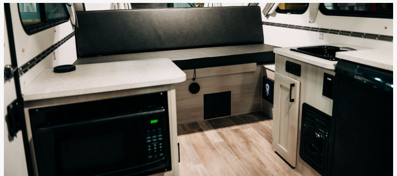
2025 upgraded Aliner flooring in all models

In addition to these aesthetic upgrades, every Aliner now features balancing beads for automatic tire balancing, new interior lighting to replace the bright blue nightlight, and upgraded cabinet hardware, ensuring a smoother and more enjoyable travel experience.