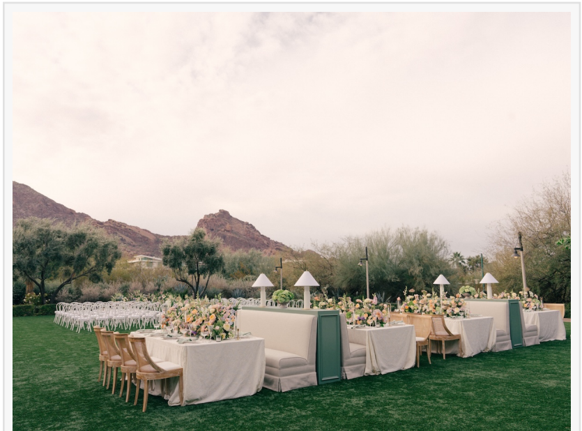
Prim Rentals shown in action at Arizona wedding reception.

To learn more about Prim Rentals, visit their website at www.primrentals.com and follow their Instagram page @primrentals for updates, inspiration, and the latest rental offerings.