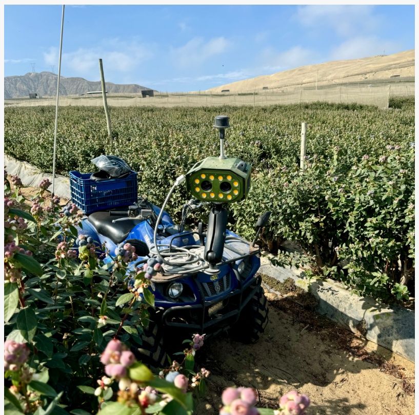
Bloomfield's FLASH Camera in blueberry field

Bloomfield Robotics is a Pittsburgh-based company that develops AI-driven plant imaging