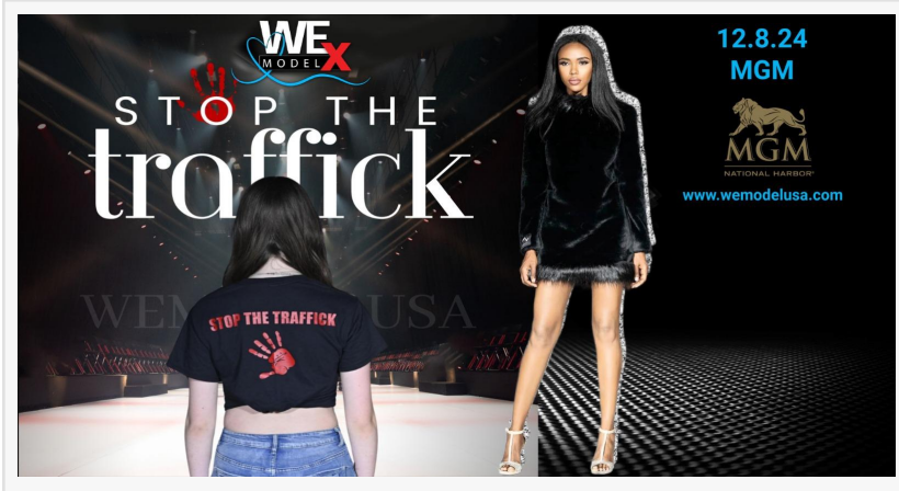
Fashion and Philanthropy