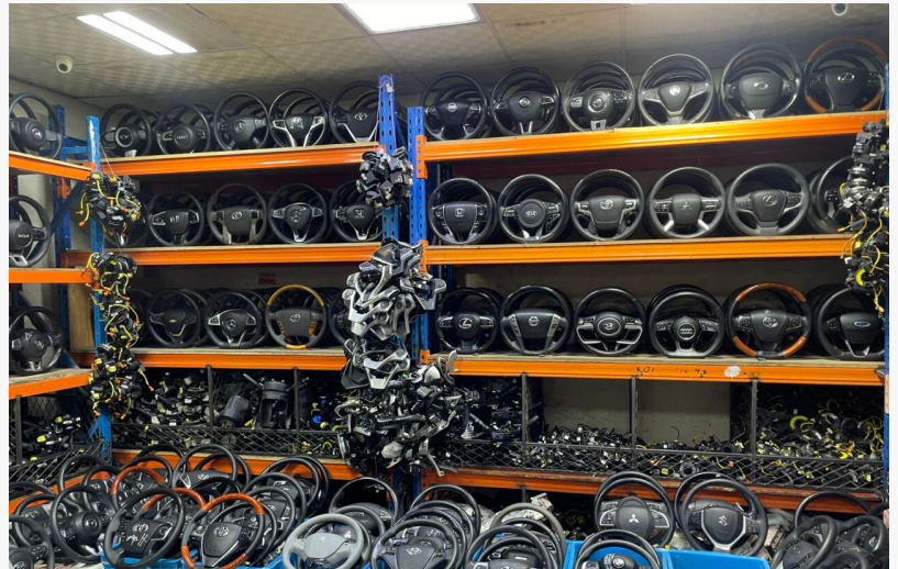
Part2Car's shop car parts