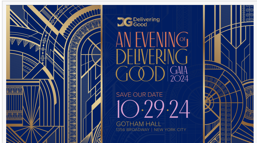
2024 Evening of Delivering Good