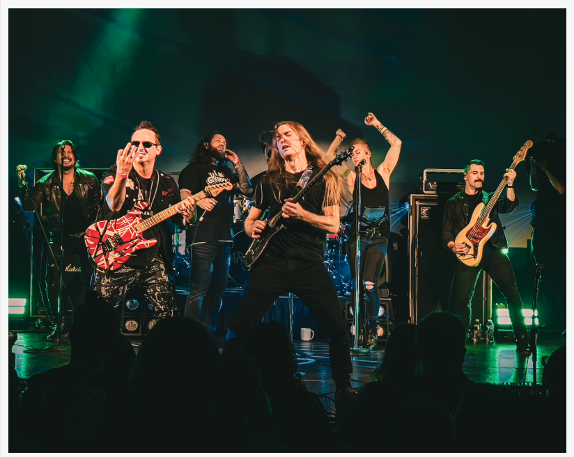
A.D.A.M. Music Project live at Tower Theater in Oklahoma City, OK