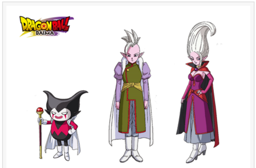
Animation designs for the new characters. Designs are based on the art by Akira Toriyama. From left: Gomah, Degesu, Dr. Arinsu.