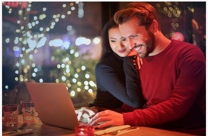
Biometric Identification and Authentication