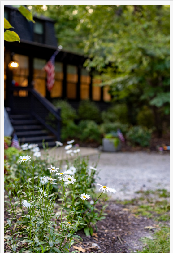
The front entry at The Neighborhood Hotel in Grand Beach, Michigan

This press release can be viewed online at: https://www.einpresswire.com/article/742658781