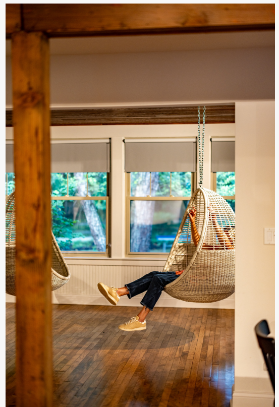
Swing chair in the lobby at The Neighborhood Hotel Grand Beach, Michigan

Throughout the weekend, participants will: