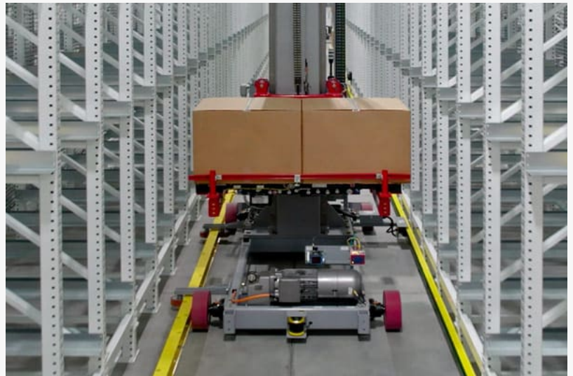
ASRS Manages a Wide Range of Loads