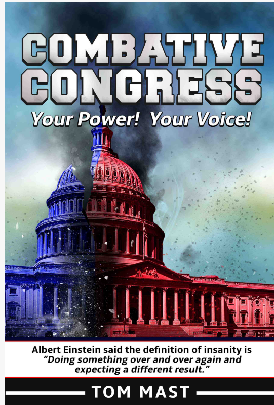
Combative Congress front cover

Combative Congress addresses a serious and complex topic in ways that make reading it pleasant. This nonpartisan book is unique in that its appeal stretches from a high school student to a professor, from a newly married person to a retired chemical engineer, and more. It was