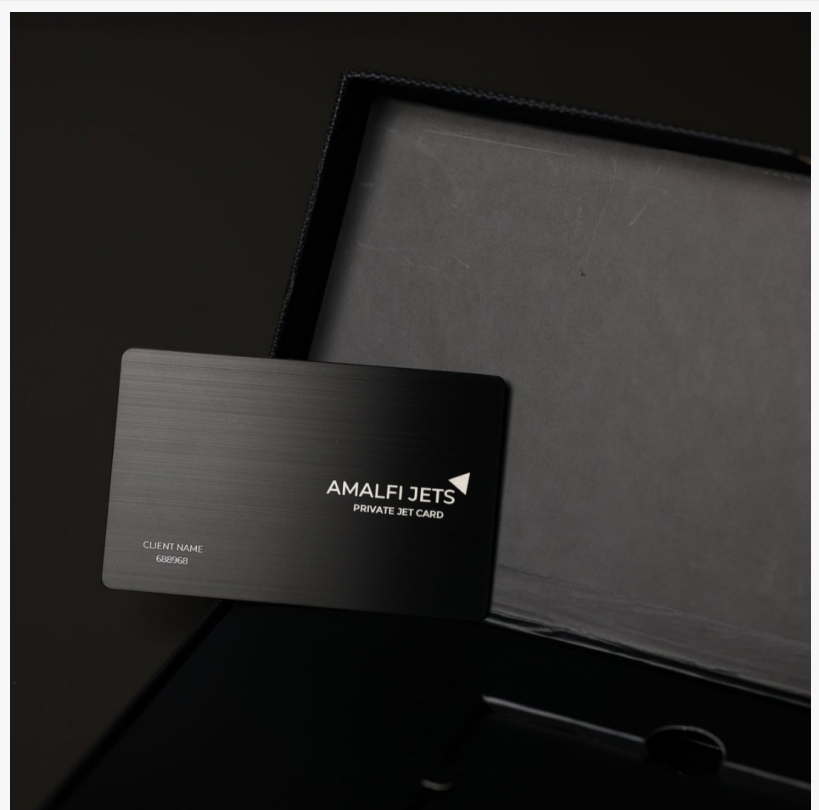
Amalfi One Jet Card

EINPresswire.com/ -- Amalfi Jets Inc., a leading global provider of private jet charters and jet cards, has released the latest findings from its 2024 dynamic pricing analysis. This internal review examined all flights booked by Amalfi One Cardholders under the dynamic pricing model throughout the year. The analysis compared the average hourly rates paid by clients to the capped hourly rates, providing a clear measure of the cost savings achieved through the dynamic pricing option.