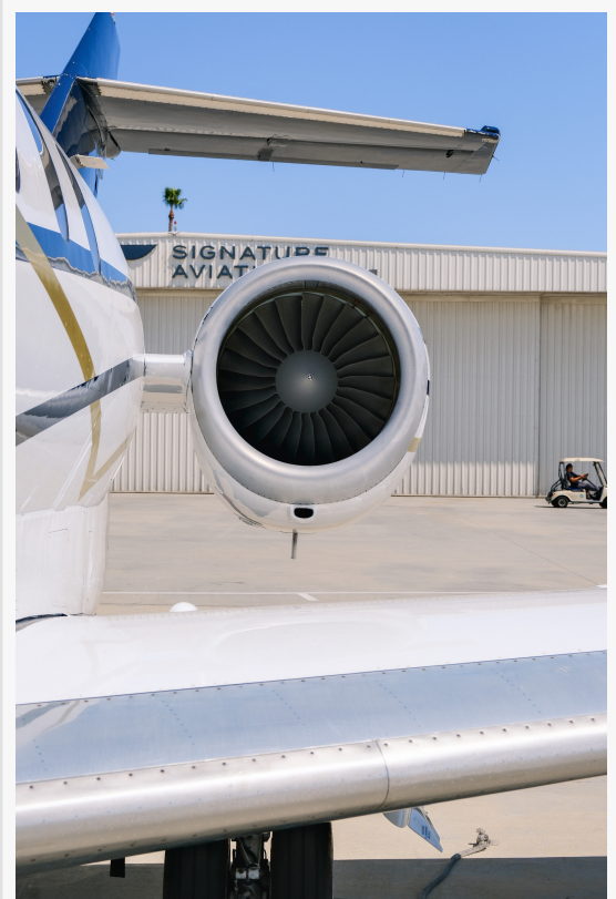
A private plane from a recent Amalfi Jets flight.

Amalfi Jets offers a wide range of services as a global private jet charter and jet card provider. With access to over 3,500 aircraft across 170+ countries, Amalfi Jets’ clients enjoy the convenience of booking every part of their trip through