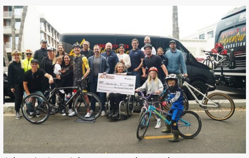
Adversity Into Adventure on the road