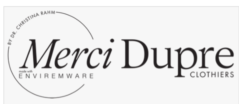
Merci Dupre Clothiers Logo

The unique line of 'Envirenware' will host patented, nano-biotech formulas infused into the fabric of the clothing by a 96-hour process, offering an