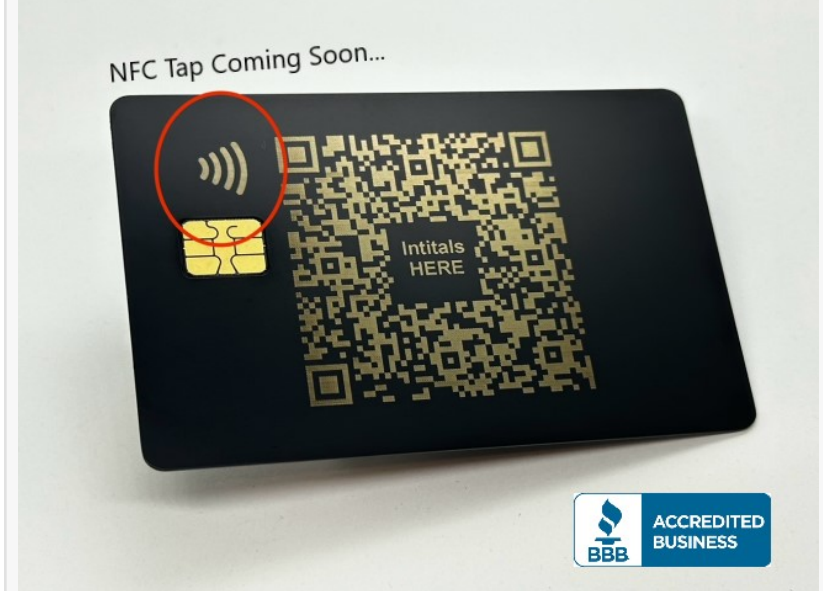
NFC Tap Business QR code metal credit card

Breakthroughs in NFC technology represent significant opportunities for the company, though the process is ongoing. The goal is to provide customers with an even more convenient and secure way to make purchases using their custom luxury metal credit cards.