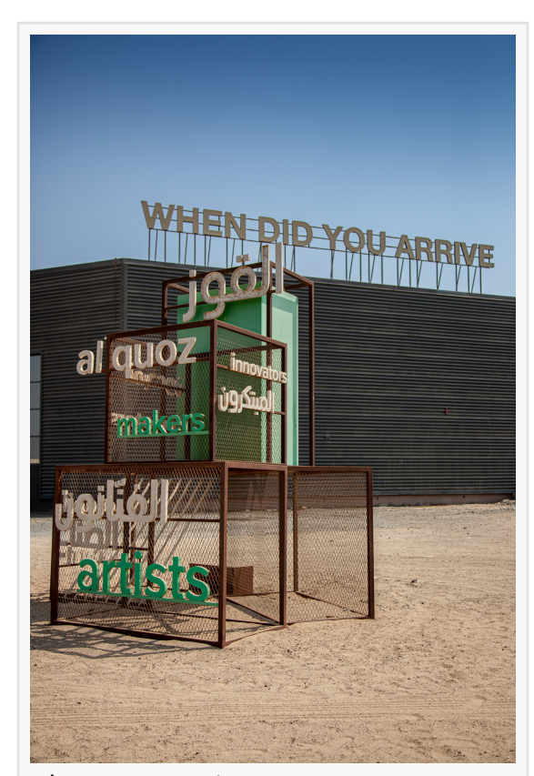
Al Quoz Creative Zone

One of <u>Dubai's flagship projects</u>, the Al Quoz Creative <u>Zone</u> that was launched in April 2021 to support the Dubai Creative Economy Strategy, is an integrated creative ecosystem that meets the requirements of talent and creative entrepreneurs who wish to invest in various areas of the creative economy. After listening to the creatives at Al Quoz Creative Zone, Dubai Culture partnered with leading entities across different sectors to develop and offer an array of services designed to