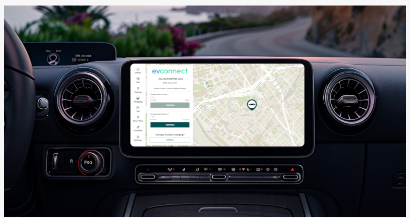
The Sheeva.AI interface for EV Connect customers