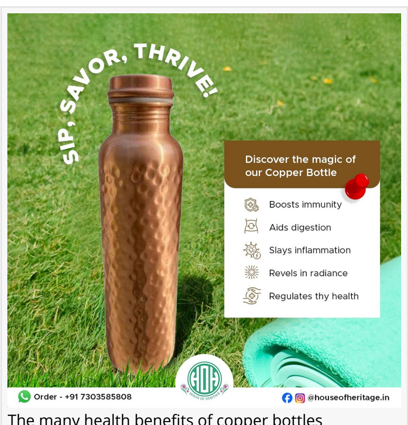
The many health benefits of copper bottles

NOIDA, UTTAR PRADESH, INDIA, September 13, 2024 / EINPresswire.com/ -- Harnessing the wisdom of ancient wellness traditions, innovative startups like House of Heritage are making time-tested practices accessible to a wider audience. One such tradition experiencing a resurgence is the use of copper water bottles. Revered for millennia in Ayurveda for their healthenhancing properties, copper vessels are experiencing a modern-day revival as today's health enthusiasts rediscover their benefits.