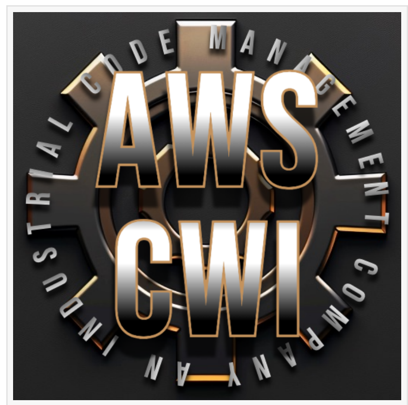
AWSCWI.COM Website Logo

The expanded Houston Welding Inspection Service specializes in AWS CWI inspections and site code compliant QC management across various environments, including