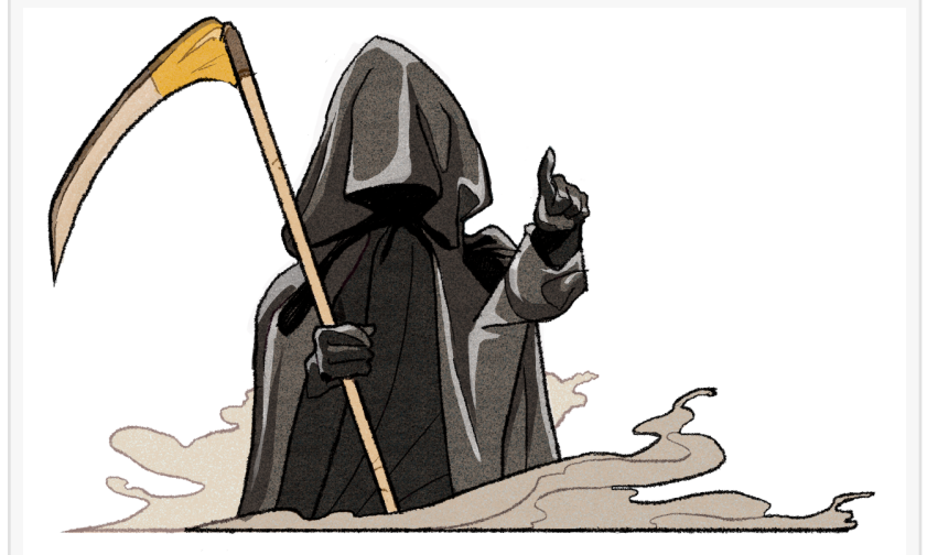
The Grim Reaper

This press release can be viewed online at: https://www.einpresswire.com/article/743068599 EIN Presswire's priority is source transparency. We do not allow opaque clients, and our editors try to be careful about weeding out false and misleading content. As a user, if you see something we have missed, please do bring it to our attention. Your help is welcome. EIN Presswire, Everyone's Internet News Presswire™, tries to define some of the boundaries that are reasonable in today's world. Please see our Editorial Guidelines for more information.