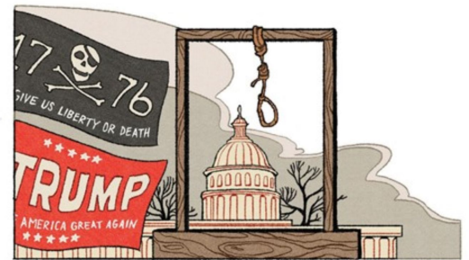
Donald Trump Meets His Maker Book Cover