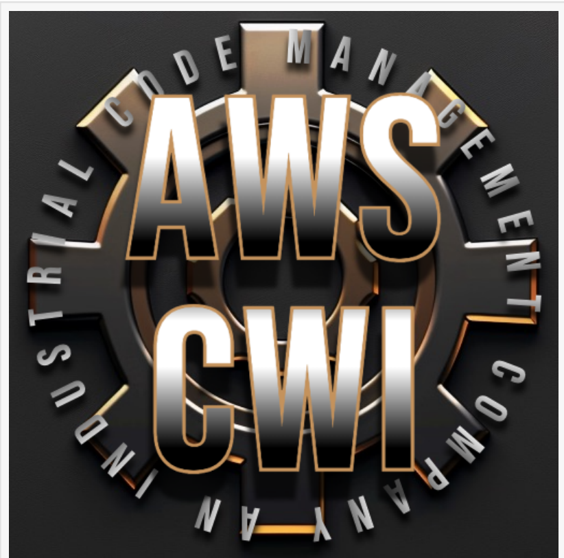
AWSCWI.COM Website Logo

The expanded Oklahoma City Welding Inspection Service specializes in AWS CWI inspections and site code compliant QC management across various environments, including military bases, government facilities, commercial projects, power plants, process plants, microprocessor projects, municipal buildings, industrial projects, pipeline welding inspection and commercial process facilities.