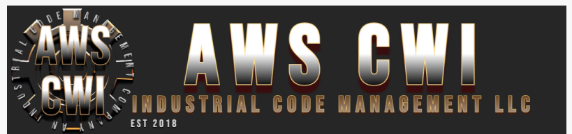
AWSCWI.COM's Precision at Work