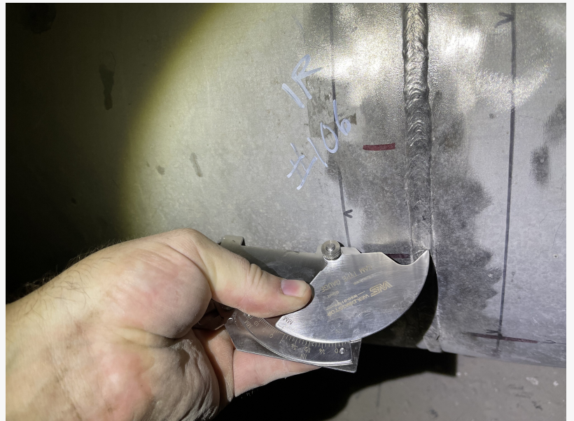
Certified AWS CWI inspectors from AWSCWI.COM documenting and evaluating a pipeline welding project.