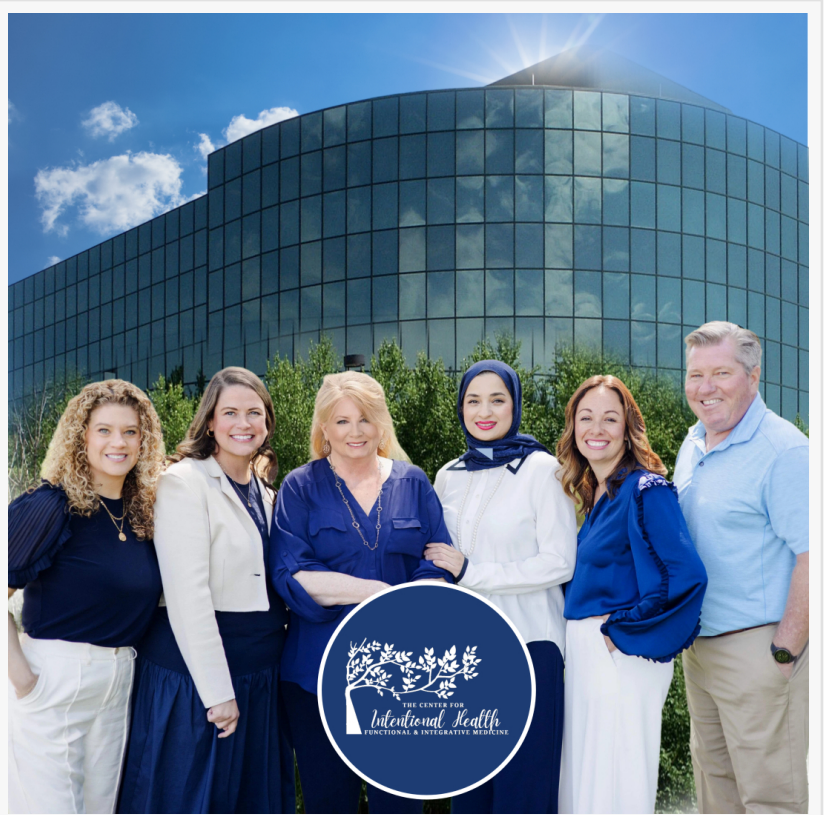
The Center for Intentional Health - Team

Developed at The Center for Intentional Health, Inc., Biomé Functional Aesthetics stands at the forefront of clinical care, providing a comprehensive and integrative approach to treating skin affected by aging and conditions such as acne, dermatitis and eczema. By individualizing client care and utilizing a blend of traditional and innovative therapies, this unique new service offers unparalleled results.