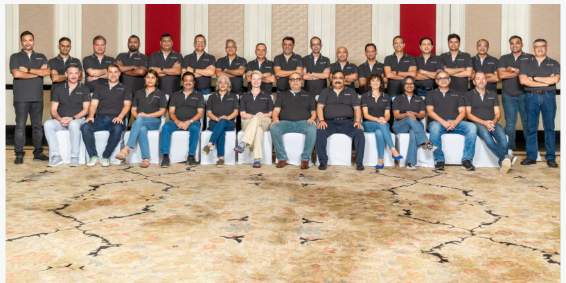
From strength to strength the Leadership grows at Atmosphere Core.