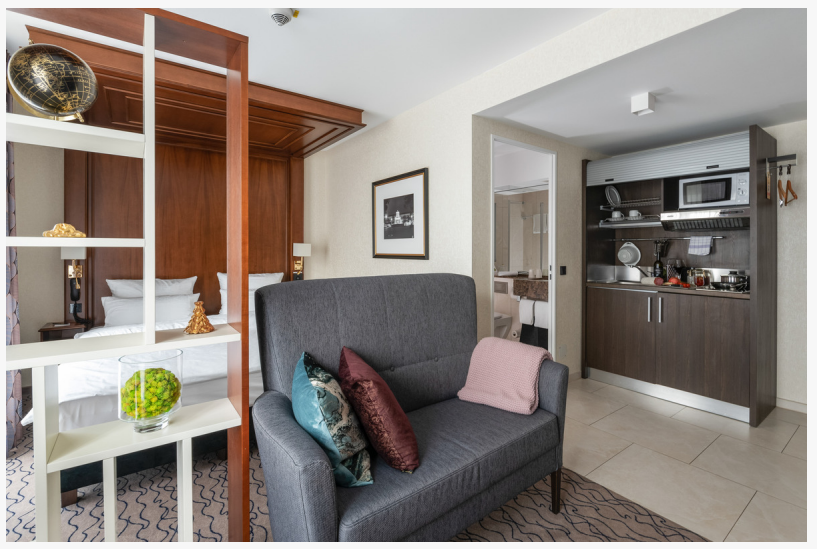
KING's Advastay Apartment

AdvaStay by KING's: Flexibility for the Modern Traveler AdvaStay by KING's, located just across the street from KING's Hotel First, caters to the modern traveller who values independence and flexibility. The aparthotel offers fully-equipped