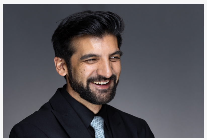
Las Vegas Convention Headshot Photographer

professionals, corporate teams, and businesses in the Las Vegas area.