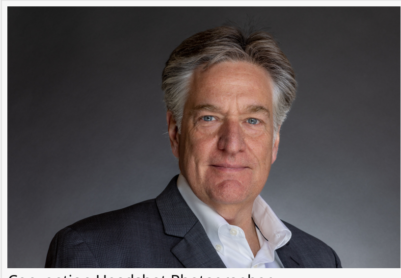
Convention Headshot Photographer

This is why they have invested in topof-the-line mobile studio lighting equipment, designed to bring the sophistication of studio-quality