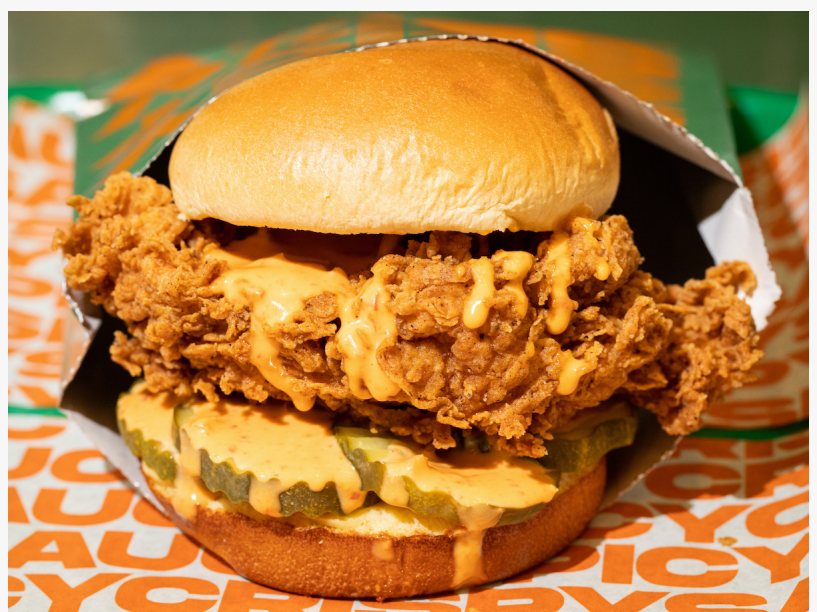
fuku OG Sando

MetLife Stadium, located in East Rutherford, NJ, is the home of the New York Jets and New York Giants and is one of the largest stadiums in the NFL (82,500). The stadium hosts the world's biggest events on the world's biggest stage and will host the FIFA World Cup 26™ Final and 7 other matches throughout the tournament. The venue annually ranks as one of the busiest stadiums in the world and has been named "Highest Grossing Stadium of the Year" 9 times by Billboard. Event highlights include Super Bowl XLVIII, NHL Stadium Series, WrestleMania, Copa America Centenario Final, 2021 Army-Navy Game, and many concerts, college football games, and international soccer matches.