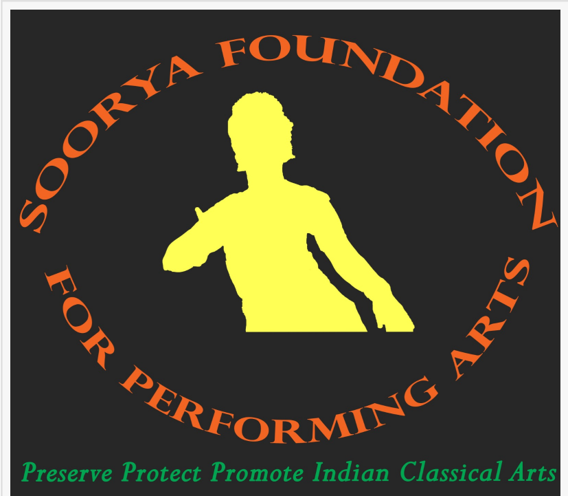
Soorya Foundation - Indian Dance Fest

The festival will highlight performances by renowned classical dance companies, featuring local Indian dance schools such as Laya Naadham School of Music in Los Angeles, Kathak Kala Kendra in Chatsworth, Soorya Ensemble in Canoga Park, Nataraja Arts Academy in Simi Valley, SciArtsRUs in Thousand Oaks, and ShivaShakthi Natyalaya in Agoura Hills. Additionally,