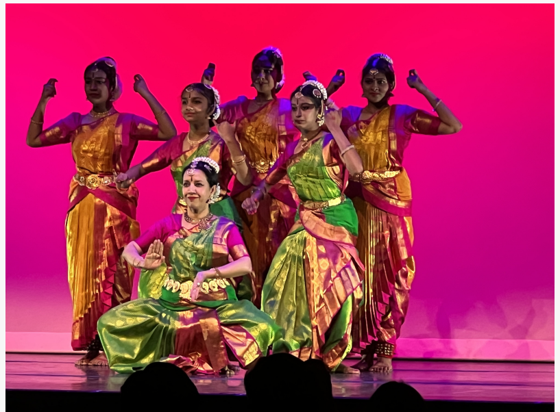
Soorya Foundation - 2023 Indian Dance Fest