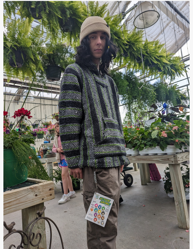
Action Aroma on the Go!