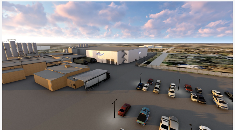
Expansion rendering provided by E. A. Bonelli Architects + Engineers