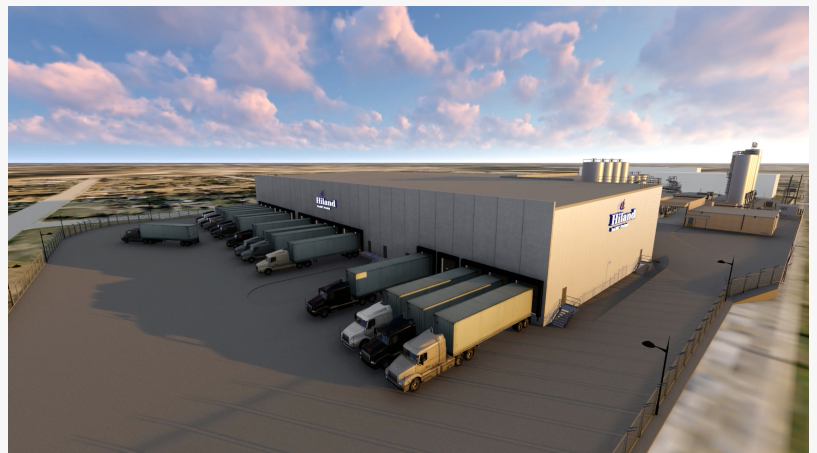
Expansion rendering provided by E. A. Bonelli Architects + Engineers