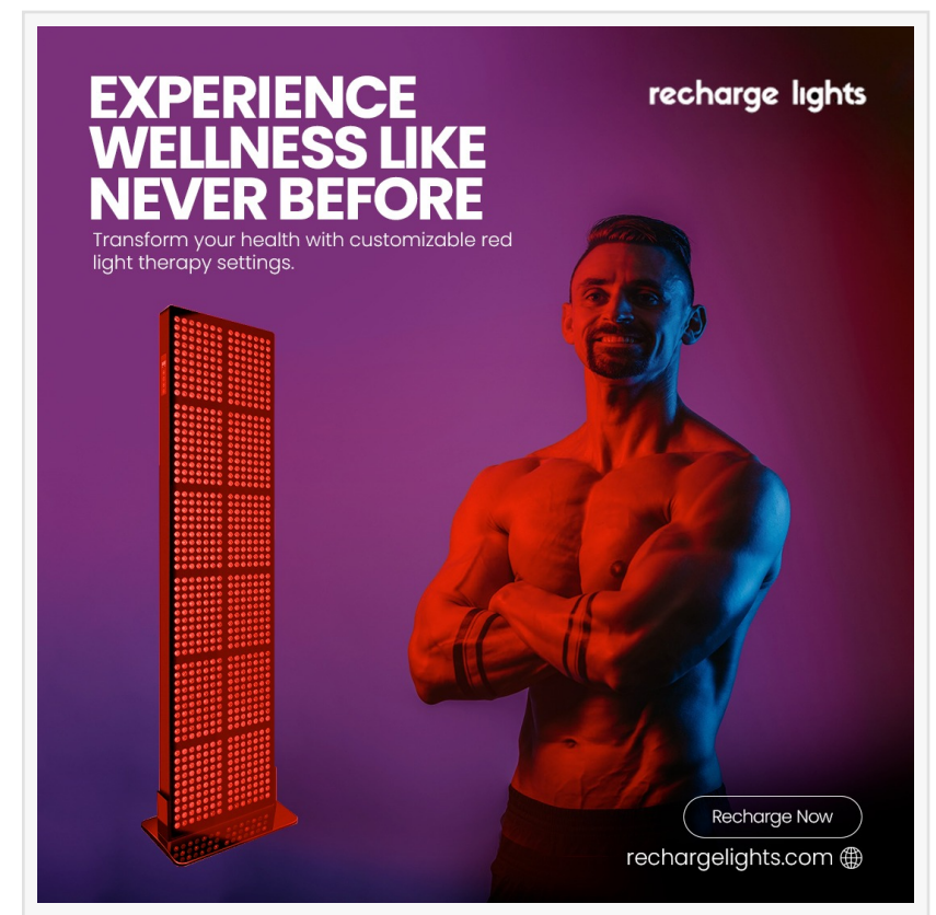
Recharge Lights : Experience Wellness Like Never Before