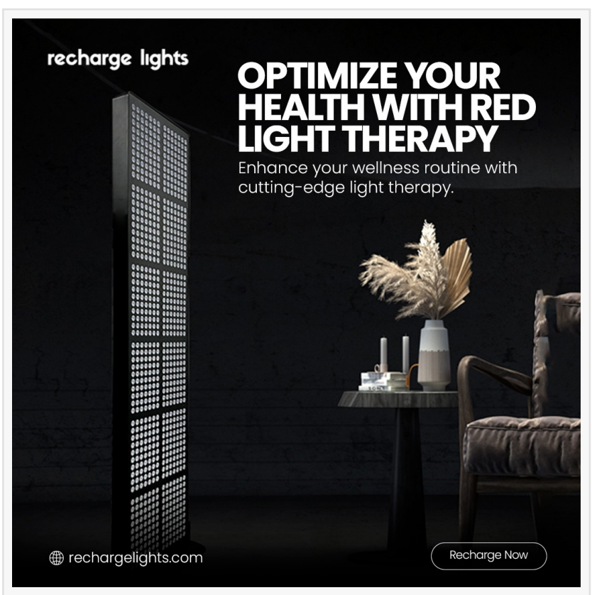
Recharge Lights : Optimize your Health with Red Light Therapy

For the first time, professional-grade red light therapy panels are accessible for at-home use. Recharge Lights' new lineup offers a diverse range of options