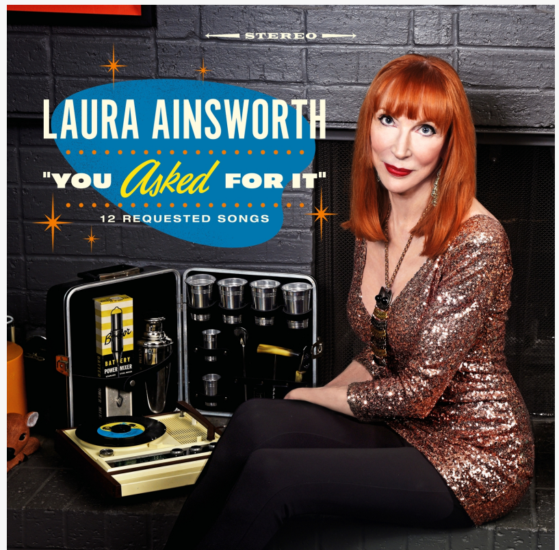
Retro jazz vocalist Laura Ainsworth's album of fan requests, "You Asked For It"

This press release can be viewed online at: https://www.einpresswire.com/article/743591990