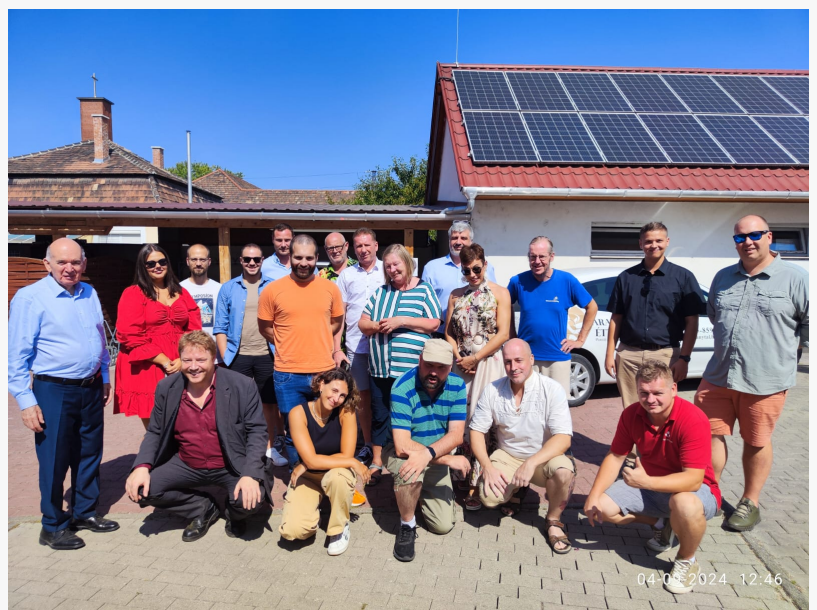
Roundtable discussion with Slovakian and Hungarian citizens on cross-border cooperation, Schengen, and the Danube. Group photo taken at Restaurant Aranytál, Komárom.