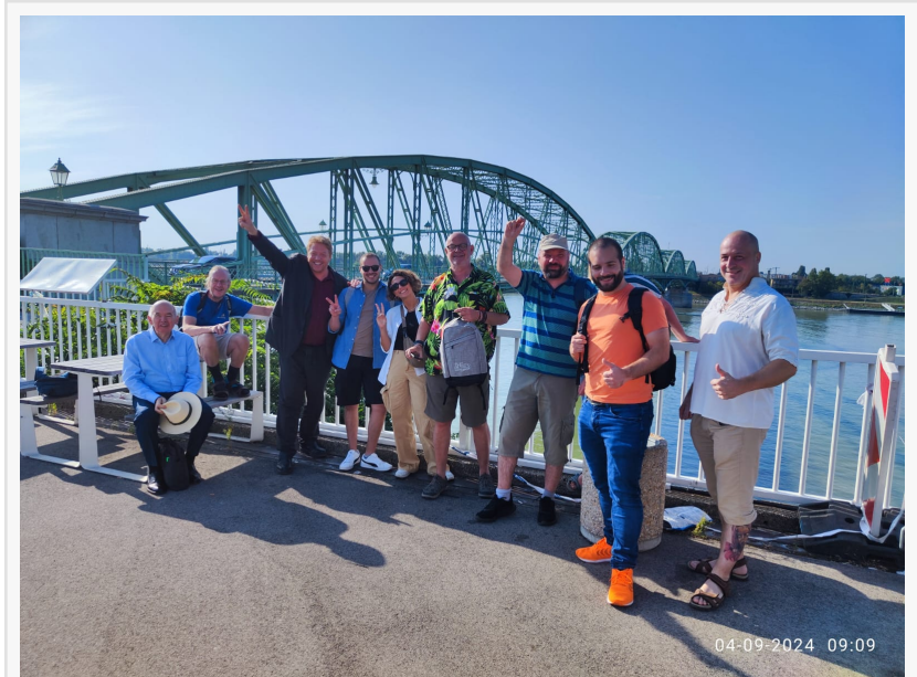
Group photo of our journalists just after departing to a local market in Slovakia.

BUDAPEST, HUNGARY, September 16, 2024 /EINPresswire.com/ -- From September 3 to 12, 2024, a group of journalists and civil society representatives embarked on an intensive journey through five Eastern European countries — Hungary, Croatia, Slovakia, Romania, and Bulgaria — to evaluate the impact of the European Cohesion Fund in these regions. This trip, known as Cohesion Field Visit 1, revealed the crucial role of EU investments in promoting cross-border cooperation, community building, and regional development. Throughout the journey, participants engaged with local communities, government representatives, and experts to gain insight into the successes and challenges of the EU Cohesion Policy.