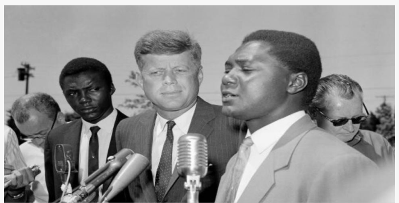
President Kennedy Supported Tom Mboya & Birth of Kenya The Kennedy foundation supported the Kenya Airlifts for Kenya and African Students transportation and support to attend schools in America Kenya owes a debt of gratitude