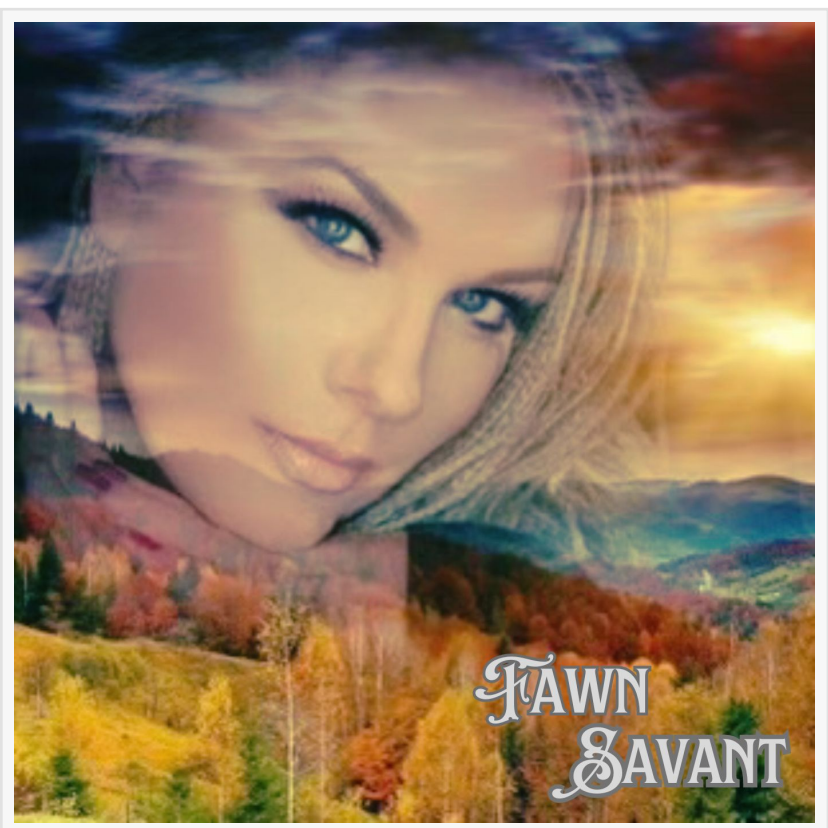
Album cover of Savant. Photo of Fawn taken by Satu

LOS ANGELES, CA, UNITED STATES, September 24, 2024 / EINPresswire.com/ -- Stonedef Records, Inc. and Songirl Music announces the upcoming release of "Savant," the latest single by Billboard hit recording artist and composer Fawn. This highly anticipated track by the Berklee College of Music graduate will be available on all music platforms starting October 1, 2024. The musical work showcases a piano-based instrumental arrangement complemented by Fawn's own backing vocals and lush orchestrations by composer and producer Cameron Lasswell.