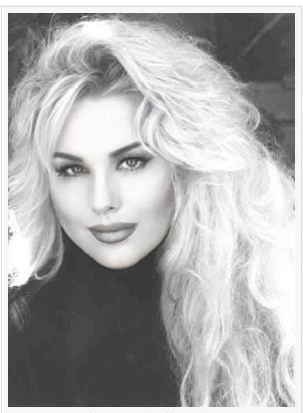
Fawn in Hollywood Hills.

Χ LinkedIn Instagram YouTube TikTok Other