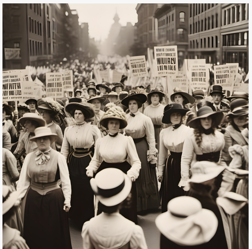
A chilling triple murder rocks their sleepy Massachusetts town and a young suffragist is wrongfully accused