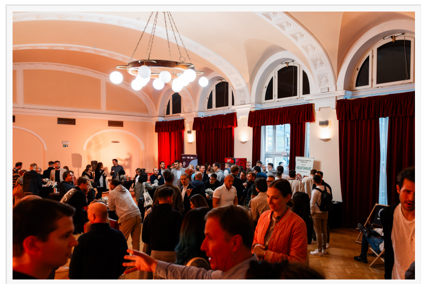
Networking at dragondays

"Dragondays is much more than just a conference for our ecosystem. It's a call to awareness that we are building the future together. Innovation and technology are its building blocks. Only in this way will we remain relevant and technologically self-sufficient in the long term. Dragondays is a hub for innovators, entrepreneurs, investors, and academics, and an excellent opportunity to present ideas and research on a global scale while